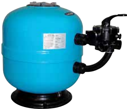
Manufactured from extremely hard wearing glass reinforced polyester Lacron’s LSR filters are ideal for light to medium commercial installations.

For the Hurlingham project, the Hydroxypure system was paired with a Lacron 24” LSR sand filter. These filters are specifically designed for light to medium commercial installations. The main tank structure is made from hard wearing glass reinforced polyester and the smooth, high gloss internal and external finish ensures free flow and easy cleaning.