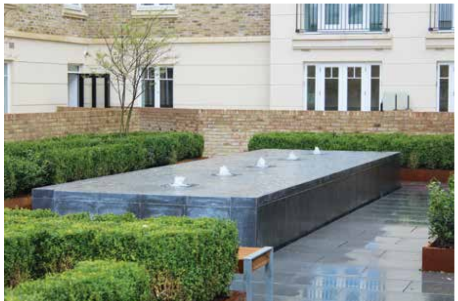
▲ Hydroxypure system is the ideal solution for the centrally located water feature.

Each of the 68 apartments in Hurlingham Walk has its own balcony or terrace that overlooks the central courtyard – and with the development spanning over six floors, there is certainly an audience to bear witness to the consistent water quality and lack of odours.